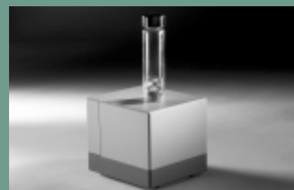
Diffuse Reflectance Accessory