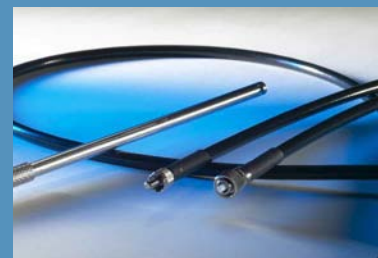
Liquid Transmission Probe