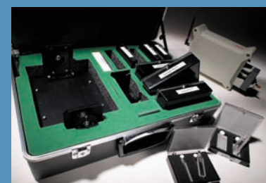
Gas/Liquid Accessory Kit

For more information Contact Axsun at: 1 Fortune Drive Billerica, MA 01821 Attn: Sales Department 978.262.0049 Visit us on the Web: www.axsun.com