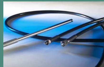
Liquid Transmission Probe