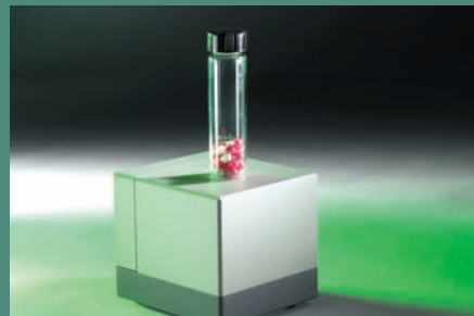
Diffuse Reflectance Accessory