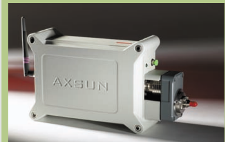
NIR Analyzer XL for application development