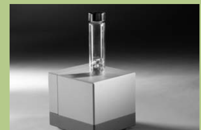
Diffuse Reflectance Accessory